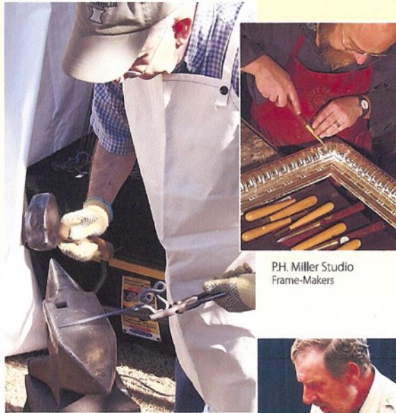
P.H. Miller Studio Frame-Makers

We invite you to watch, listen and discuss As selected artisans share their knowledge and expertise in a series of fun and informative booth chats and demonstrations. Learn About the hows and whys of carving, grain painting, sailors' valentines, joinery and much more.